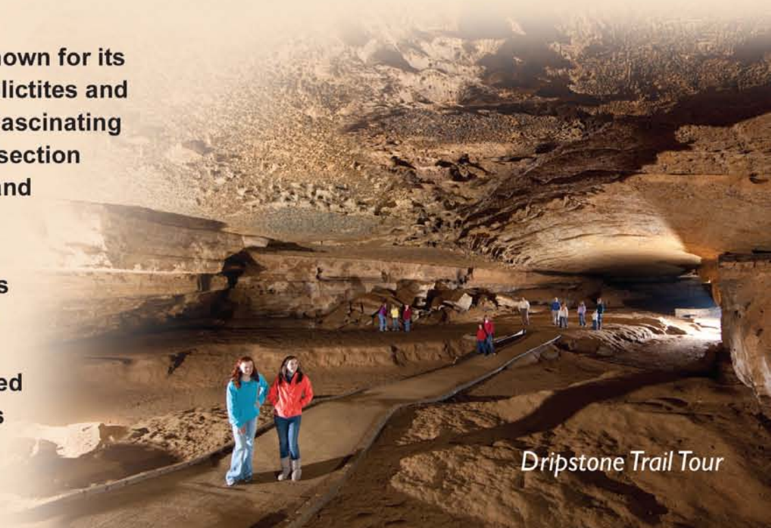
Dripstone Trail Tour

Marengo Cave remains 52 degrees year-round. Comfortable walking shoes and a light jacket are recommended. All tours are guided by knowledgeable, friendly guides on well-lighted tour trails.